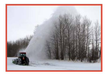
Improved snow blowing

The RDX-117 drum is made of Hardox 450 which has a hardness of 450 BHN or 48 Rockwell C. This drum is very hard and is very resistant to abrasion from rocks, gravel and other debris. It will provide a long and trouble free service life.